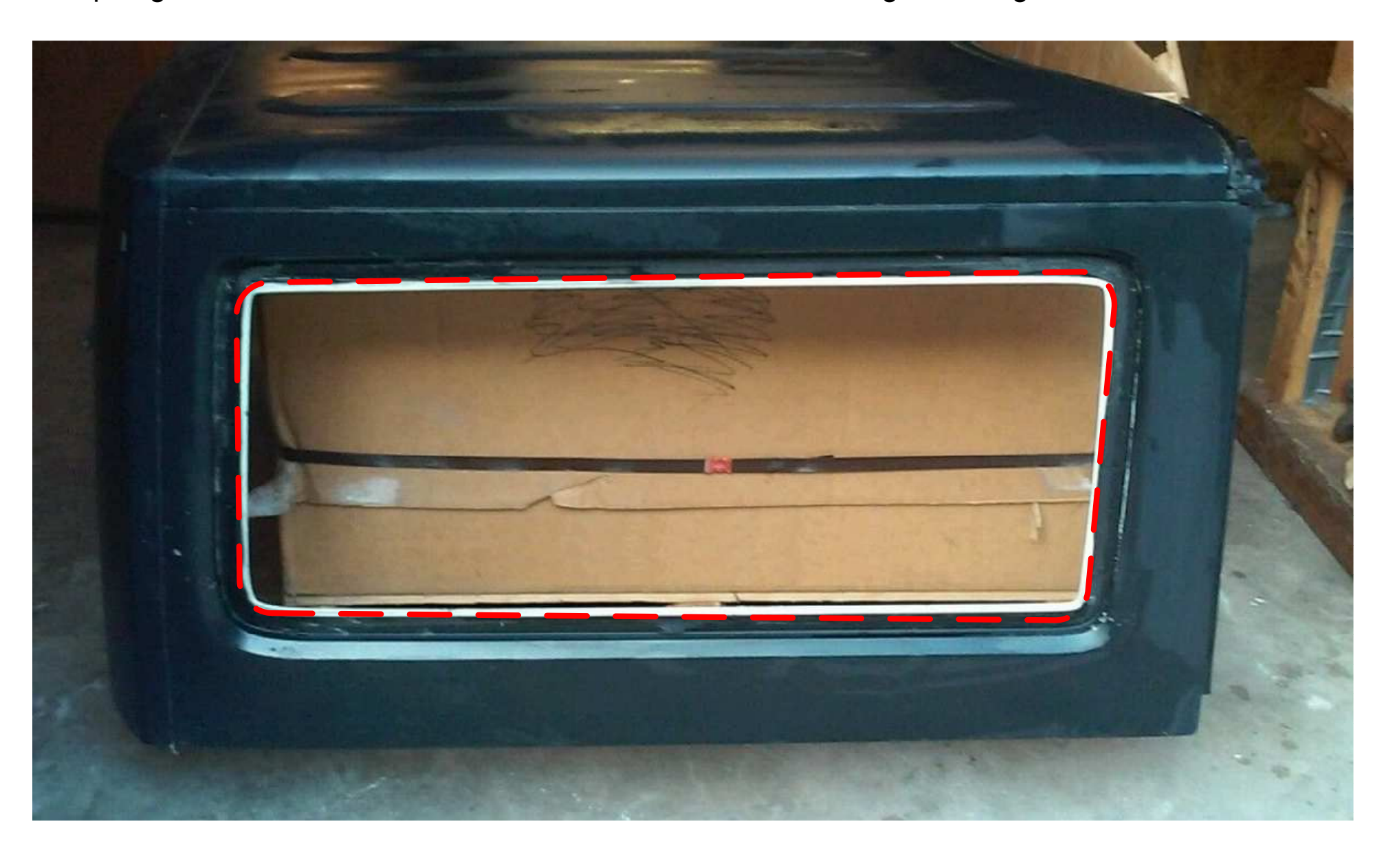
Step 3: The inside edge of the window opening will need to be trimmed to allow the window to fit. The hardtop will look like the photo below once the factory window is removed; the area to be trimmed is shown with a dashed red line. A very fine blade in a handheld electric jigsaw, such as a metal-cutting blade, will cut through the fiberglass well. The cut line can be marked by tracing the window clamp ring that comes with the kit. Wear a dust mask when cutting the fiberglass.